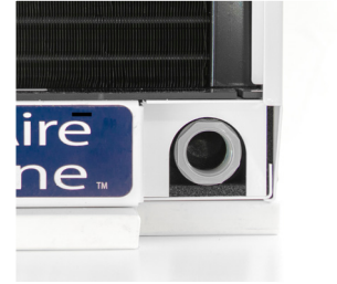
Drain line discharge