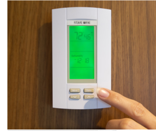
Wall-mounted Smart Automatic Humidistat