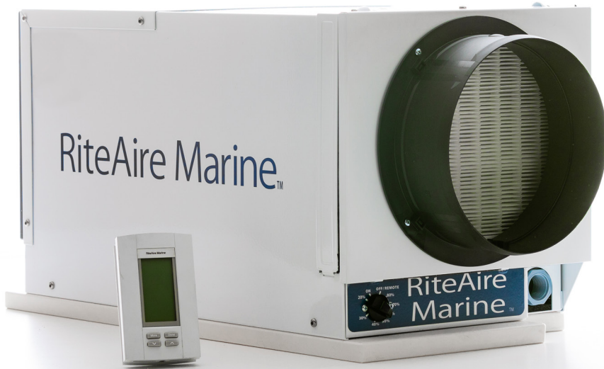
RiteAire Marine™ dehumidifier system shown with Smart Automatic Humidistat