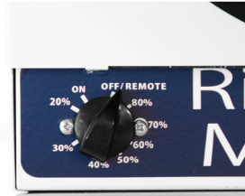
Secondary manual built-in humidistat controller